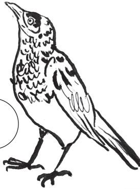
NOISY MINER Manorina melanocephala