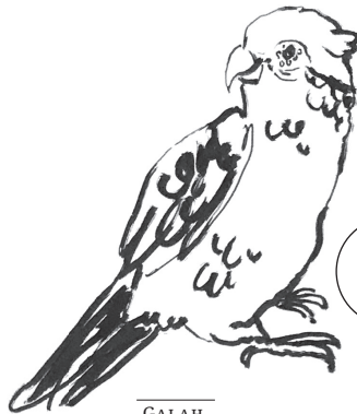
GALAH Eolophus roseicapilla