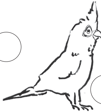
LITTLE CORELLA Cacatua sanguinea