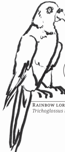
RAINBOW LORIKEET Trichoglossus moluccanus