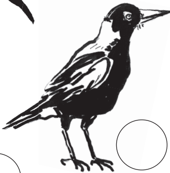
AUSTRALIAN MAGPIE Gymnorhina tibicen

AUSSIE BACKYARD BIRD COUNT. Spend 20 minutes outdoors, count the number of birds you see (mark in the circles, draw your own birds on the back), report: aussiebirdcount.org.au