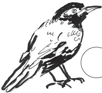
COMMON/INDIAN MYNA Acridotheres tristis