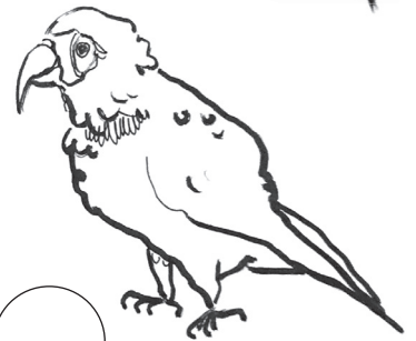
LONG-BILLED CORELLA Cacatua tenuirostris