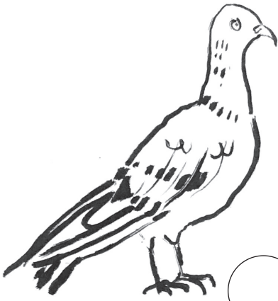
COMMON PIGEON / ROCK DOVE Columba livia