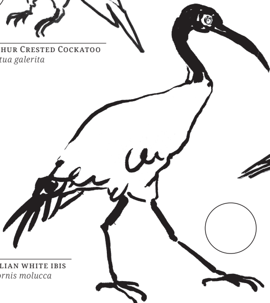
AUSTRALIAN WHITE IBIS Threskiornis molucca