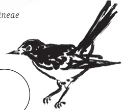
WILLIE WAGTAIL Rhipidura leucophrys