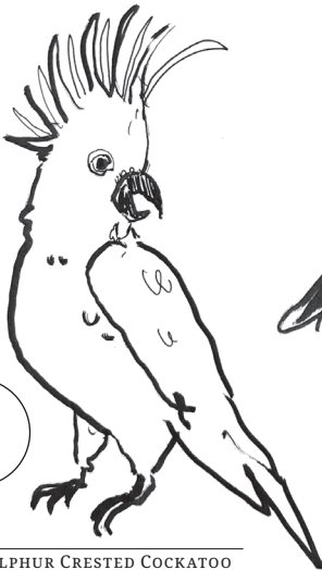
SULPHUR CRESTED COCKATOO Cacatua galerita