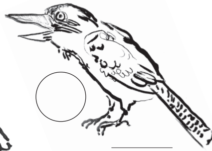
KOOKABURRA Dacelo novaeguineae