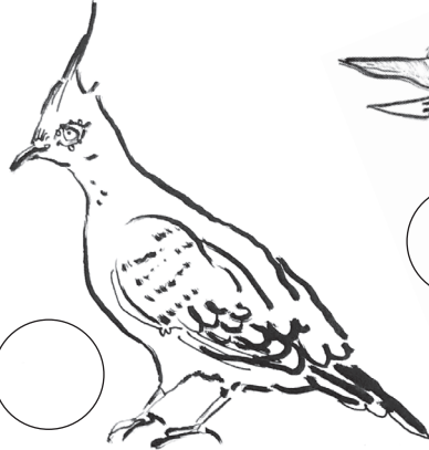
CRESTED PIGEON Ocyphaps lophotes